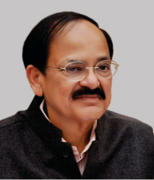
एम. वेंकैया नायडु M. VENKAI AH NAIDU